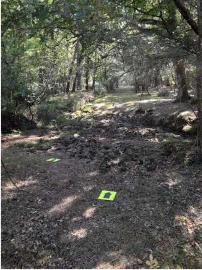
Alternative crossing to the bog! 😊